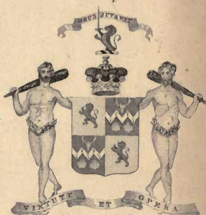
Macduff, Lord of Fife.