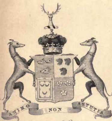
Duke of Gordon.