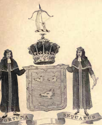
Gordon, Earl of Aberdeen.