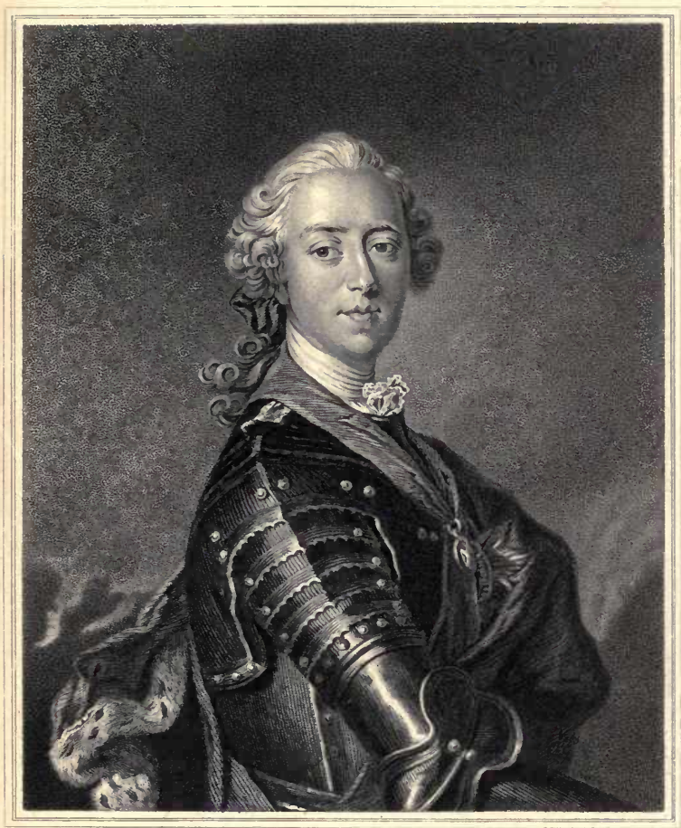
Prince Charles Edward Stuart.