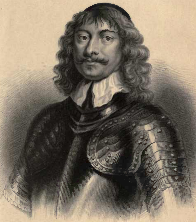
James Graham, Marquis of Montrose