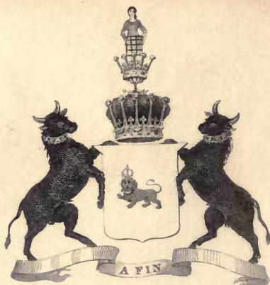
Ogilvy, Earl of Airly.